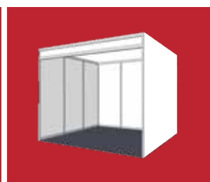
Regular Booth - 1 Side Open

(02)-7-218-7748 | elvis@efe.ph Globe: +63-927-395-1575 | Smart: +63-928-732-5557