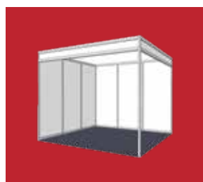
Corner Booth - 2 Sides Open

Booth space, wall panels, fascia with company's name and booth number, fluorescent light, 300W electricity socket, 1 table, 2 chairs, and carpet